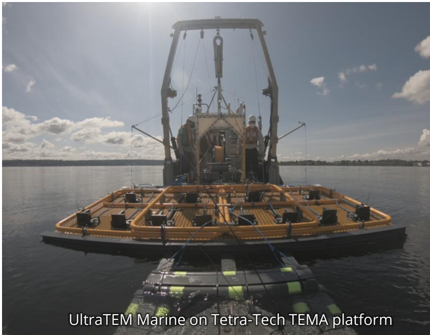
UltraTEM Marine on Tetra-Tech TEMA platform