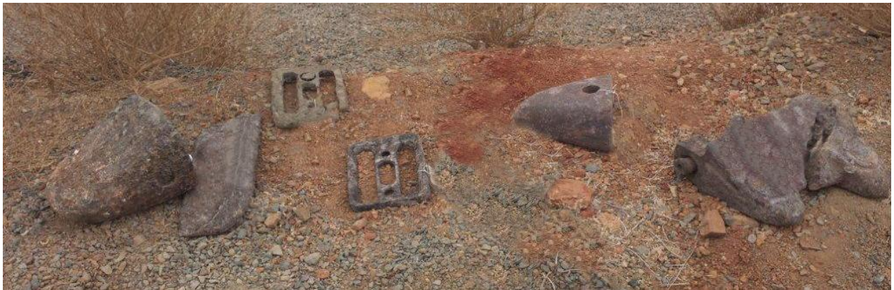
FIGURE 6. SOME OF THE PIECES OF GET RECOVERED IN A MAGNETITE STOCKPILE IN WESTERN AUSTRALIA.

At the Citic Pacific's Cape Preston magnetite mine, GapEOD uses the UltraTEM system to detect GET that are lost in a magnetite stockpile to depths of at least 3.0 m for small-medium GET and deeper for large GET (Figure 6). These surveys are done with the UltraTEM fixed-loop system and a push-cart receiver system. The system has been used to scan eleven different layers of the stockpile for a total scan area of 68 Ha. With a 3 m scan depth this translates to a volume of 2 million cubic meters of ore material scanned. In the process, over 60 pieces of GET have been recovered from the stockpile with no GET making it through to the crusher in the process. Detection depths for GET items is dependent on the size of the items of interest and geophysical background response of the ore stockpile. A survey trial is the best way to establish the detection thresholds for a specific site.