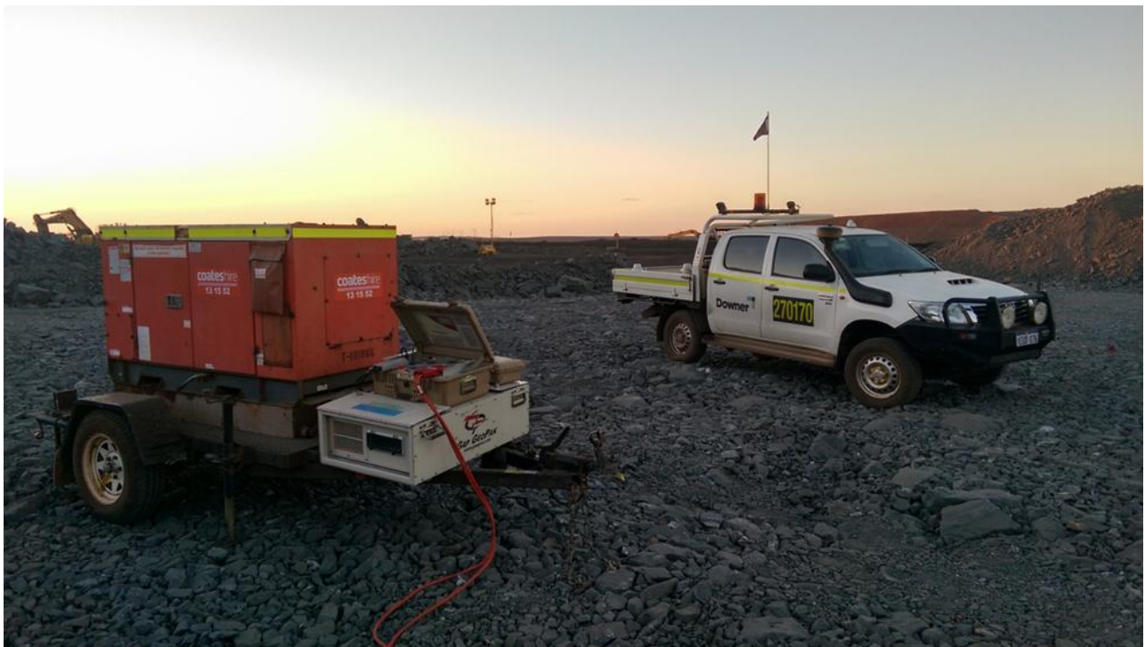
FIGURE 5. FIXED LOOP TRANSMITTER AND GENERATOR CONFIGURATION.

This system can transmit up to 200 A with a maximum output of less than 120 V. The EODTx200 has an inbuilt timing controller and can transmit at a range of base-frequency and duty cycles to suit survey requirements. It is precisely synchronized to the 1PPS signal from a GPS timing card.