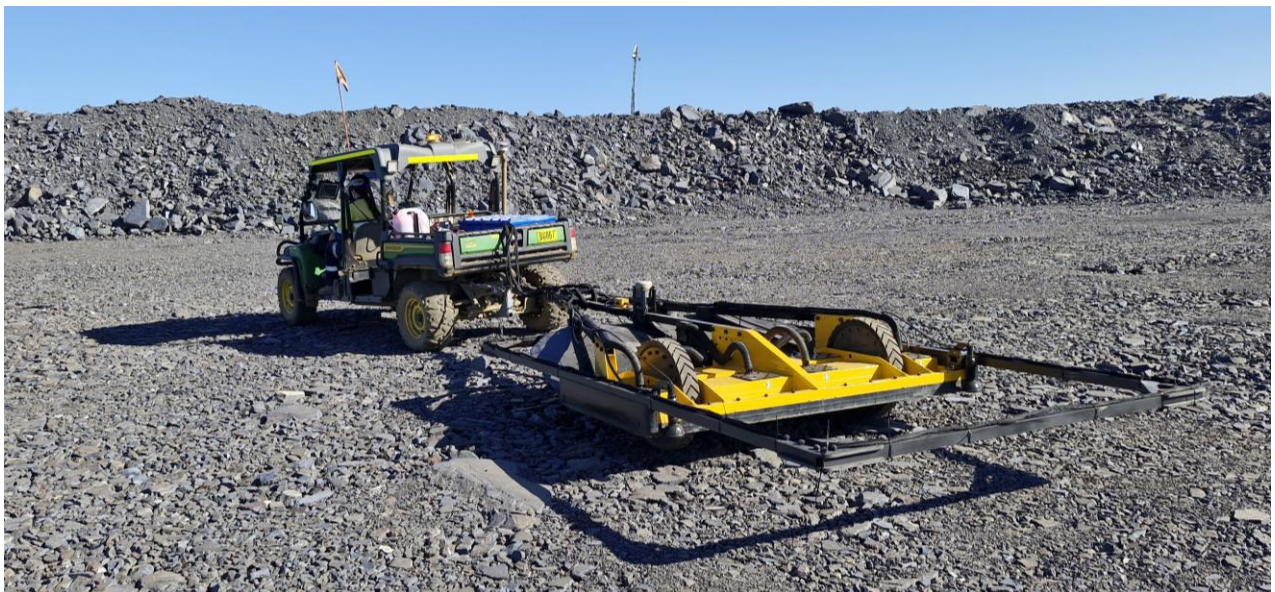
FIGURE 1. ULTRATEM MOVING LOOP TOWED-ARRAY.

The UltraTEM system can be deployed in two different primary configurations: (i) Moving Loop that focuses on rapid and efficient large-area searches (Figure 1); (ii) Fixed Loop for Ultra-Deep investigations of deep targets and for operation in geologically hostile terrain. The UltraTEM system has proven its unique capabilities in production surveys for large-area UXO detection, deep bomb detection and detection of Ground Engaging Tools (GET) in mine stockpiles.