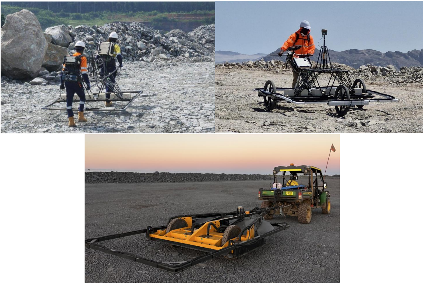
FIGURE 4. ULTRATEM MOVING LOOP FORM-FACTORS.

The UltraTEM Moving Loop towed-array system has been deployed numerous times at Newmont Boddington Gold Mine in WA and Lake Cowal Gold Mine in NSW to detect GET in ore stockpiles. Depending on the size of the GET items present, the clearance depth for this system at Boddington and Lake Cowal is between 2.5 and 3.0 m. The towed and pedestrian systems can survey approximately 2 Ha and 1 Ha per survey day respectively. Production rates can be improved if the survey area is smoothed into a large flat surface with no internal windrows or benches. Detection depths for GET items is dependent on the size of the items of interest and geophysical background response of the ore stockpile.